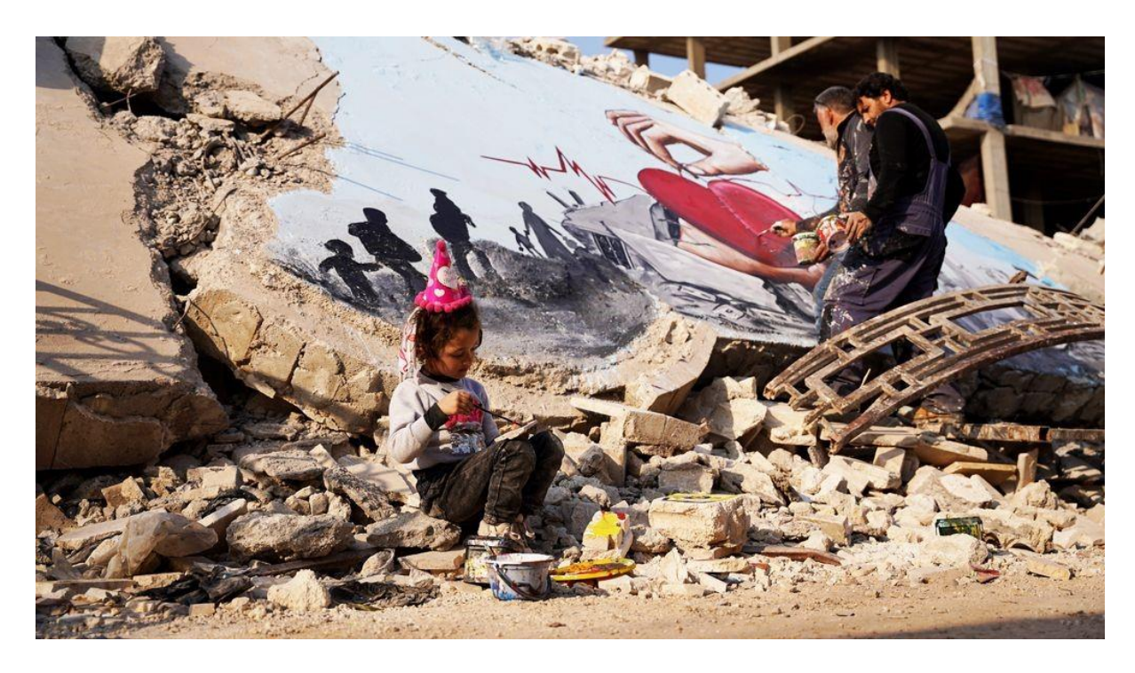
A child sits in the rubble of a collapsed building in Jindires, Syri